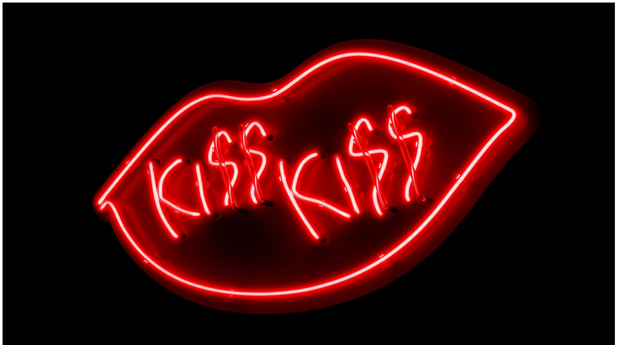
© Shu Lea Cheang, Fresh Kill , 1994, Design: Wassily Erlenbusch

Press images In the download area Hausderkunst.de/presse